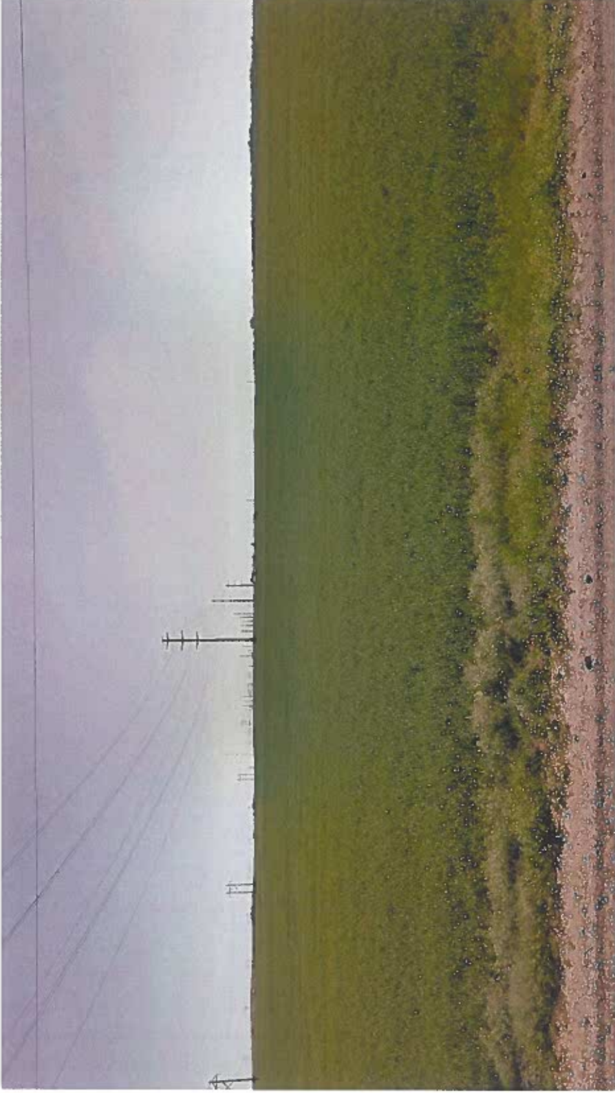
Rendering of Proposed Mountain Peak Project, Looking East from S Holmes Rd